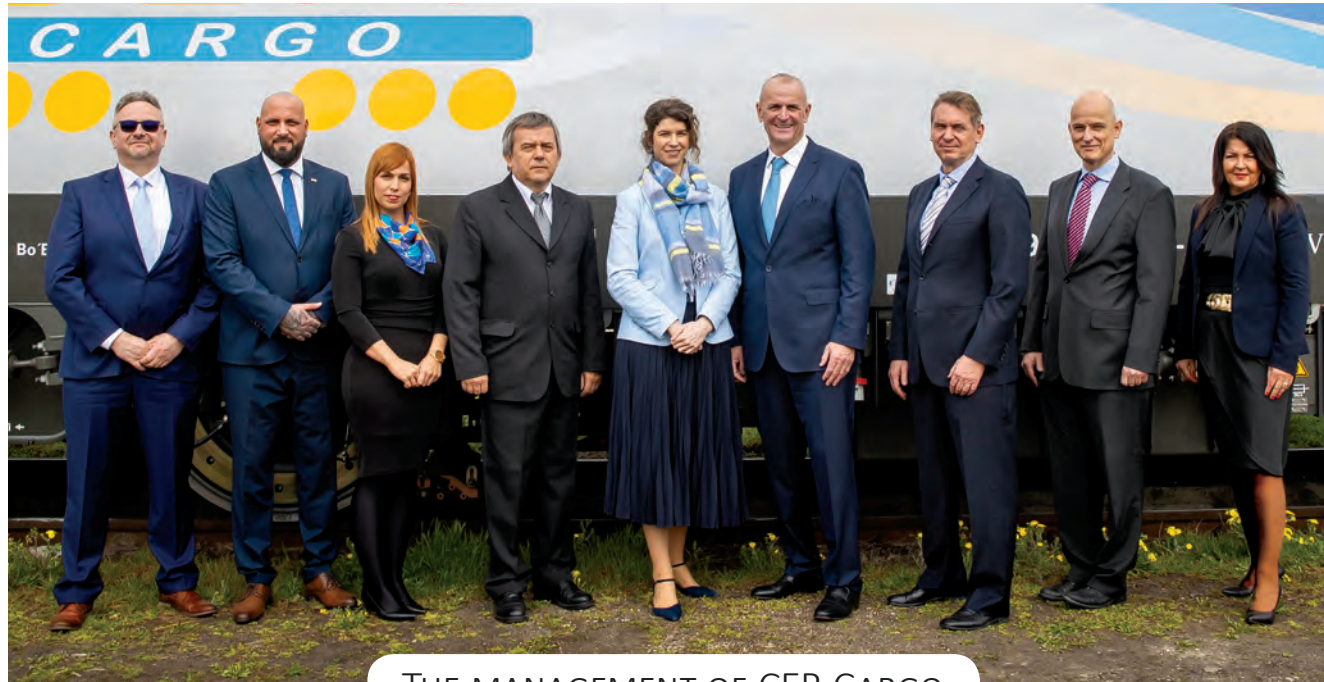
THE MANAGEMENT OF CER CARGO

Our customers are our company's higher priorities, we are committed to fulfilling their expectations in all respects. That is why we are proud of the reputation we have built with the help of our highly qualified professional team, while offering economical and efficient solutions to our partners.